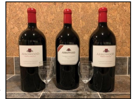
▲ Shown above, an exquisite collection from Arrowood Winery available for bid—Valued at $2,400.

Featured in our Live Auction is a vertical of "Three Big Boys from Sonoma" that is sure to impress! This lot features three, 5-liter bottles of 2008, 2009, and 2010 Sonoma County Cabernet Sauvignon Réserve Spéciale from Arrowood Winery and is valued at $2,400. The 2008 vintage integrates delectable aromas of chocolate, dark fruit, and oak, to create a structured finish. The 2009 features aromas of spice, cedar, tobacco, and black cherry—a perfect combination for autumn festivities. Finally, the 2010 is a precise blend of black cherry and black currant, intermixed with notions of loamy soils and vanillin. All three received Robert Parker ratings of 91 or above. This exquisite selection of wines is a must-have for any wine lover's collection!