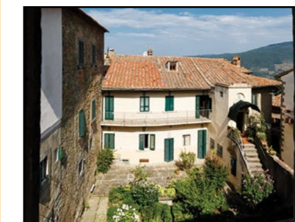
▲ Tantalizing Tuscany—only one of five spectacular trips to be auctioned this year.

A charming trip to Tuscany is just one of the many experience lots we have available for bidding this year! This travel package includes a one-week stay at the gorgeous Casa Giulia in the heart of the Tuscan countryside, a gourmet cooking class during your stay, complimentary concierge service, and expert assistance in planning your stay. This trip is the perfect relaxing getaway to enjoy a beautiful country, delicious food and wine. Watch for our Live and Silent Auction Catalogs to be posted on our website in mid-September to view all of the wines, and other fine lifestyle items we have available.